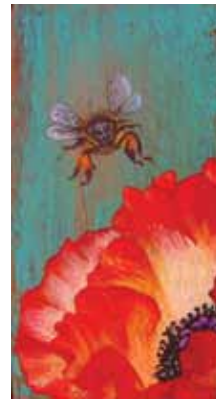
Title: Poppy Bee Artist: Cló Laurencelle Collection: The Art Studios