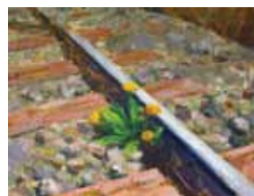
Title: Temporary Beauty Artist: Julian Hahn Collection: The Art Studios