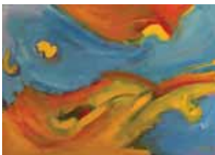
Title: Blue Orange Artist: Sandra Yuen Mackay Collection: The Art Studios