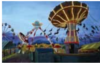
Title: Taken for a Ride Artist: Bev Knight Collection: The Art Studios